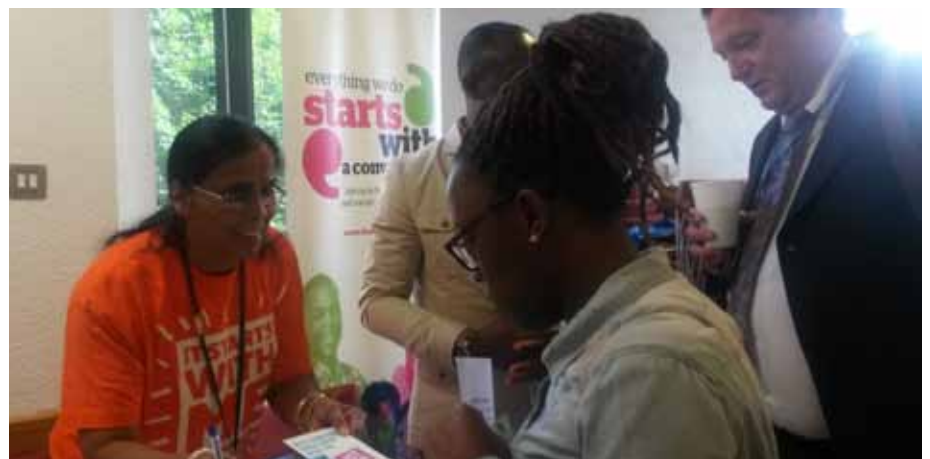
A health buddy provides information about HIV

In the 1980s and 90s some people died soon after diagnosis, but now treatments are much more effective. If people with HIV start treatment while they are still healthy, they can now expect to live as long as a person without HIV.