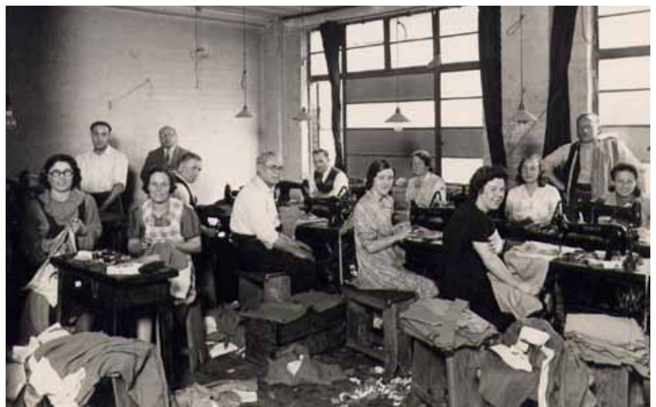
Jewish rag trade workers in the East End, about 1950